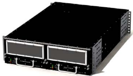
2400W UPS System MIL-2400-115A