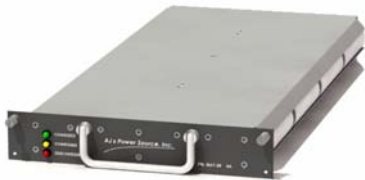
Battery Module BAT-28-9.0A