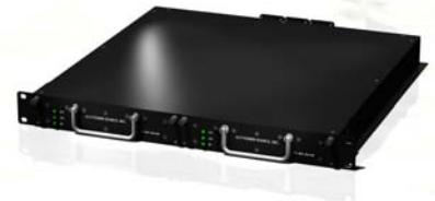
Battery Expander MIL-EXP-18A