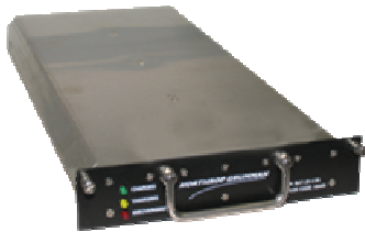
Battery Module BAT-28-9.0A