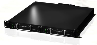
Battery Expander MIL-EXP-18A