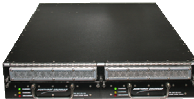
1200W UPS System MIL-UPS-115A